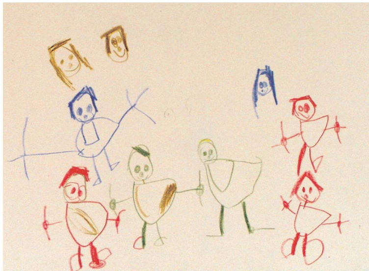
Isaac Obolensky Dell, Age 4